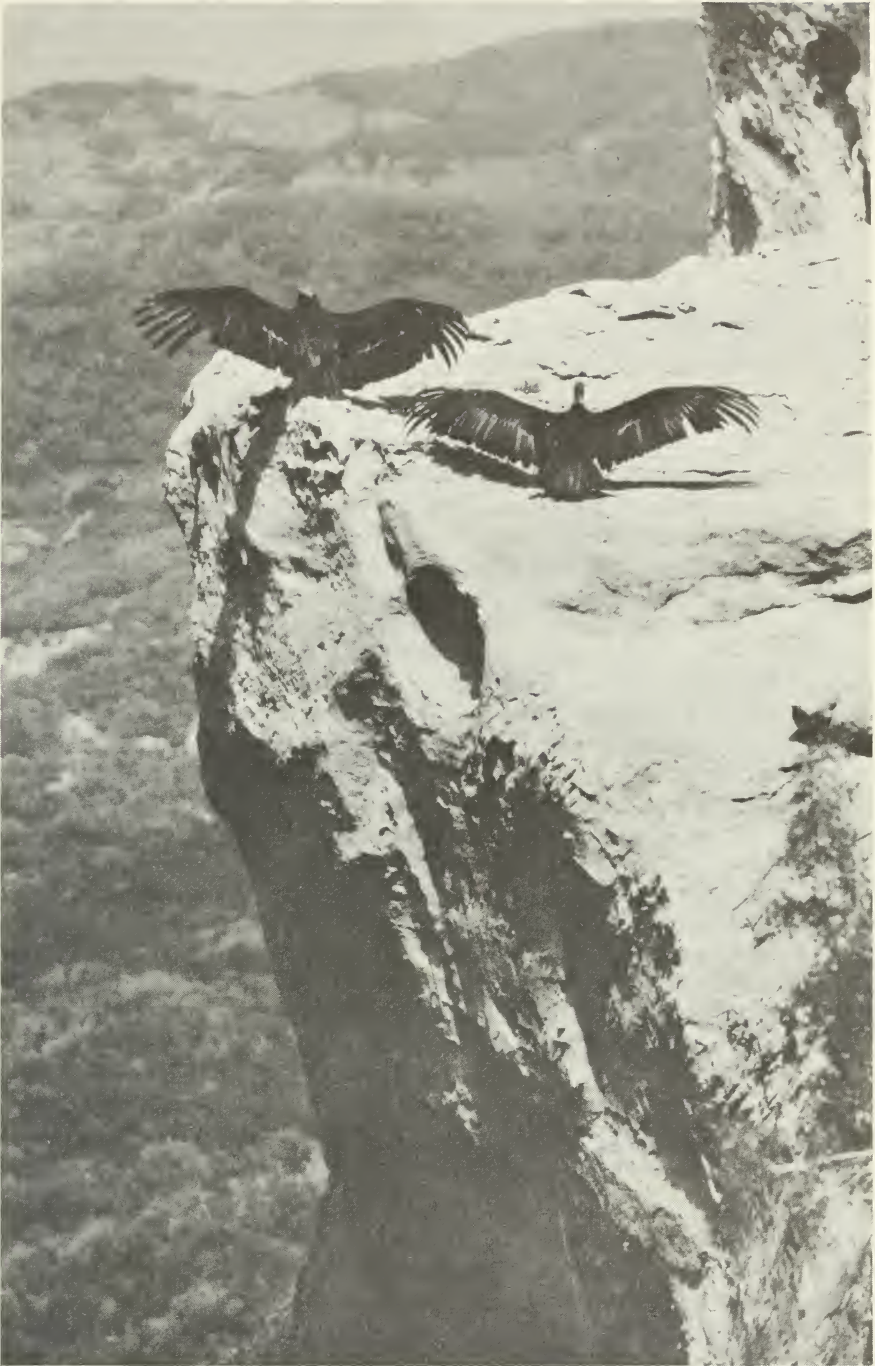
Fig. 2. Adult and immature condor in spread-wing posture, a behavior pattern shared with the storks.